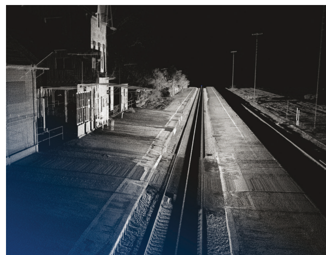
Sample data of the Wangen station captured within a few seconds