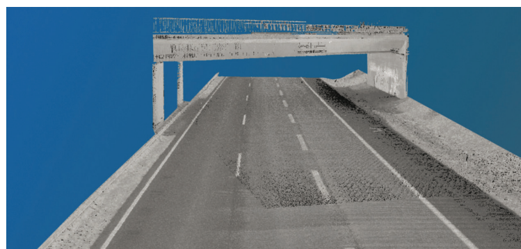
Sample data of a highway